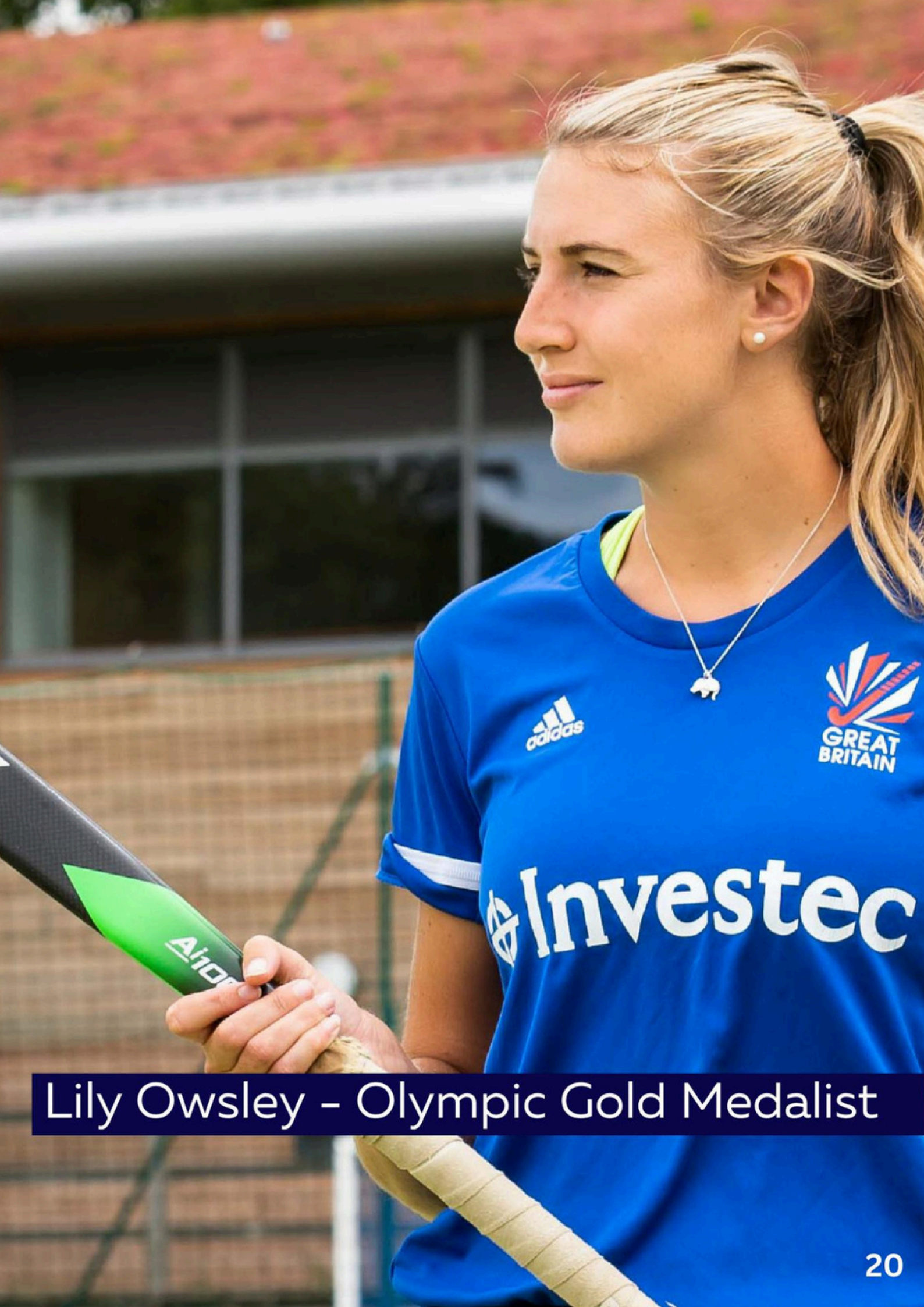
Lily Owsley – Olympic Gold Medalist