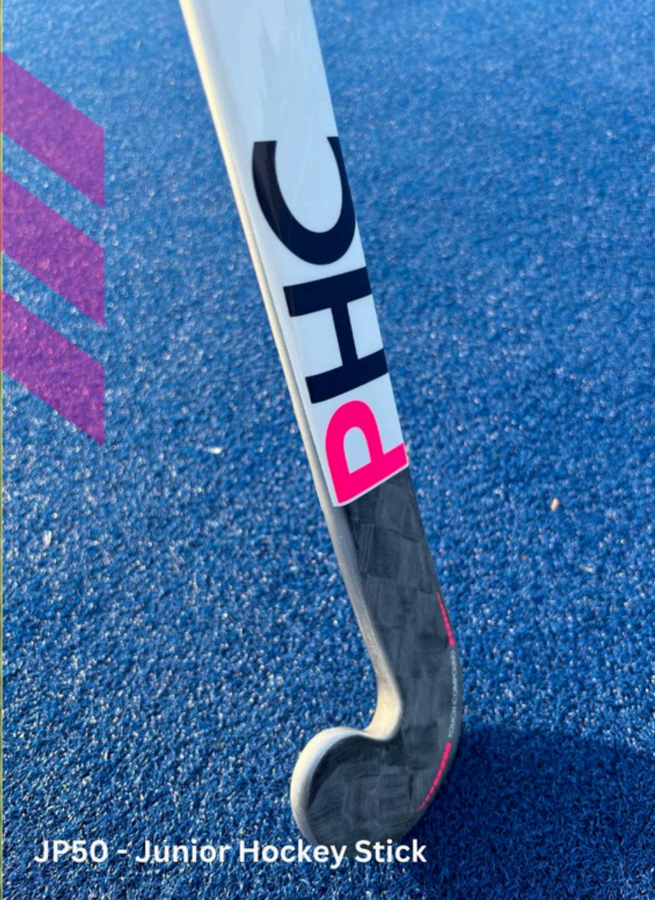
JP50 - Junior Hockey Stick